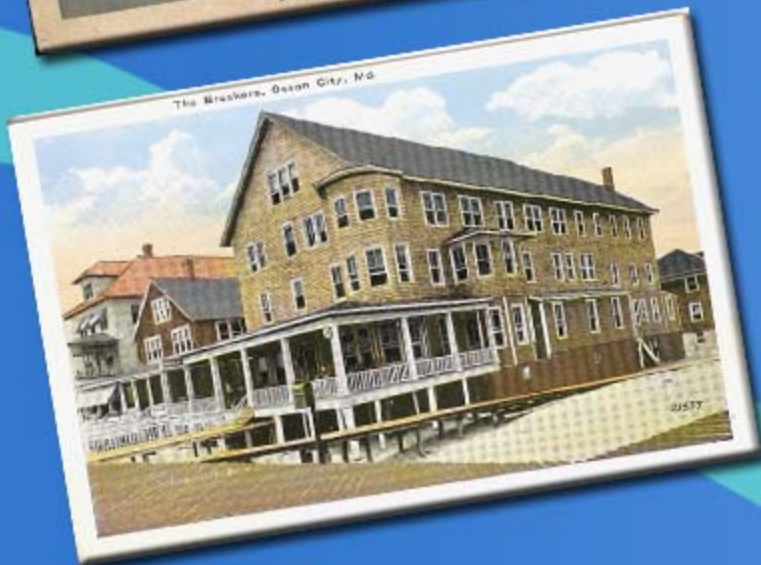
The Breakers Hotel