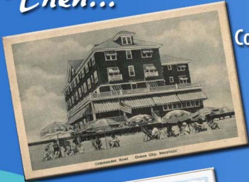
The Commander Hotel